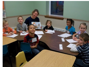
The Pre-K & Kindergarten Class