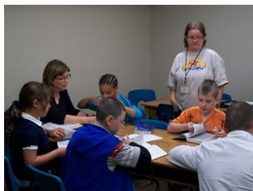
Looking Up Scripture Passages