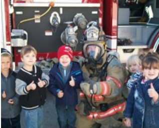
Firefighters Visit the Preschool