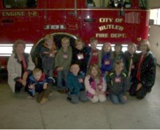
At the Fire Station!

The Pre-K students had an exciting fieldtrip to the fire station on Monday morning. The fire alarm sounded two times! Each time, we got to see the firefighters spring into action! They quickly dressed in their fire gear and departed for the emergencies! Some of the children covered their ears as the alarm sounded and the sirens wailed loudly. After all of the excitement, the children explored the fire station and learned about fire safety. They really enjoyed the folding beds in the sleeping quarters and the way firefighter Skip slid down the fire pole. Besides discovering that a fire station is a very busy and interesting place, the children also learned several important things: