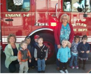
They Loved the Big Red Fire Truck