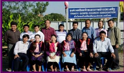
Chiang Mai Ministers and their wives