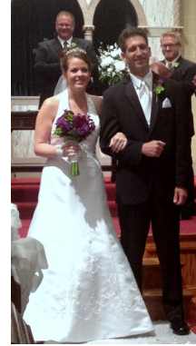
The New Mr. & Mrs!