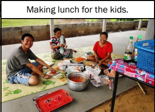
Making lunch for the kids.