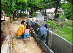
Ahta resting after coat-ing the walls.