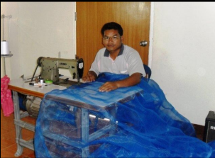
Church founder making floating basket to keep frogs alive. Frogs are market-ed for food.