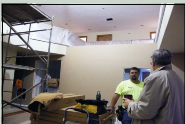
Main Level – The painting is nearly complete/lighting is being installed and trim work has begun/heating is being completed.