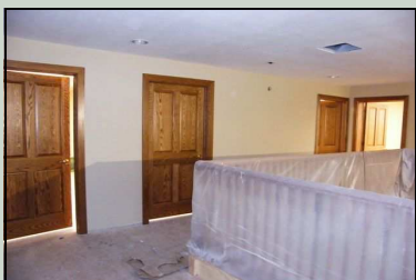
Upper Level – Painting is completed/heating is completed/lights are installed/trim work is complete – flooring is next!