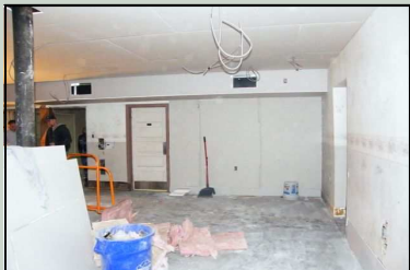
Lower Level – The dining room is being dry-walled and finished.