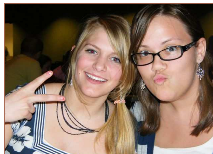
WE'RE GOING TO CIY!